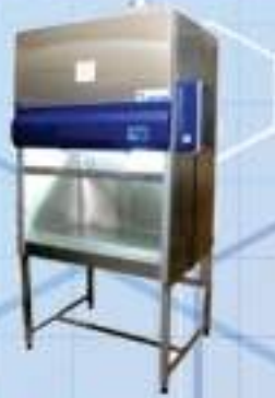
Bio Safety Cabinet