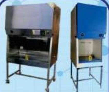
Laminar Air Flow